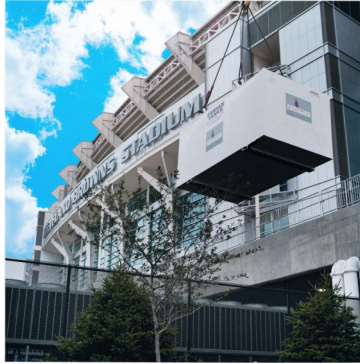
BACKUP POWER GENERATION